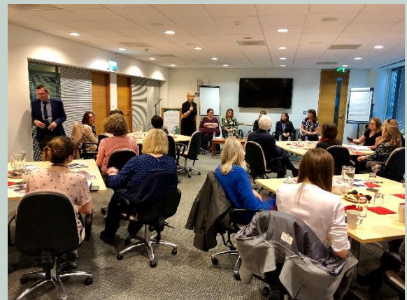
Pictured: Probation Service Staff at European Victims of Crime Day event

Representatives from five organisations each made short presentations to an audience. National Advocacy Service, Victim Support at Court, Crime Victims Helpline, CARI and Irish Tourist Assistance Service all delivered brief but enlightening presentations. This coherent and skilled delivery of a wide range of information, in a relatively short time frame, by all of the speakers was greatly appreciated.