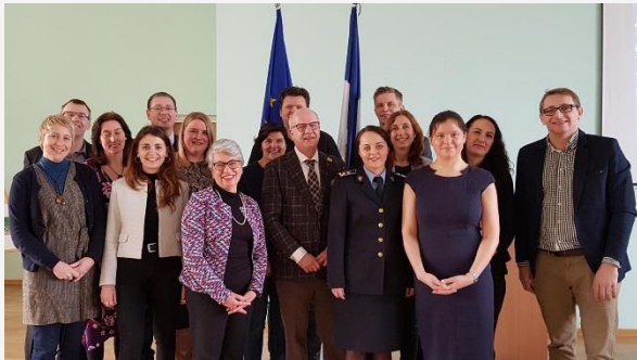
Pictured: Attendees at the Domestic Violence Experts Meeting

Domestic Violence Experts gathered in Vilnius, Lithuania on the 7th and 8th of March 2019 for the CEP and EuroPris Expert Meeting on Domestic Violence in Prison and Probation. During this first meeting of the expert group on domestic violence the group were given national presentations designed to provide a picture of whats going on in the field across Europe.