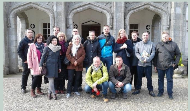
Pictured: Delegates from Czech Probation and Mediation Service

Feedback from the Czech Service was extremely positive about both the welcome they received and the professionalism of the service and the staff they met from both Probation and IPS. Thanks are owed to the Tower Programme in Clondalkin who loaned out their minibus to enable the group to be transported to the various venues over the two days. Probation staff in the prisons and community, IPS staff in Mountjoy and Shelton were all extremely helpful and most of all the contribution of service users really helped inform the experience for the visiting group. A further group of Czech staff looking at conditional release will be here in March and a group looking at Young Persons Probation in September.